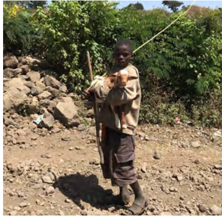
Boy carrying a goat on a road in the Tanzanian countryside.