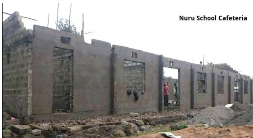
Nuru School cafeteria progress photo from last fall. The project is now complete and will be dedicated this February.

This renovation has a goal of $200,000. A generous anonymous donor has pledged a matching gift. We need to raise $100,000 to receive the gift